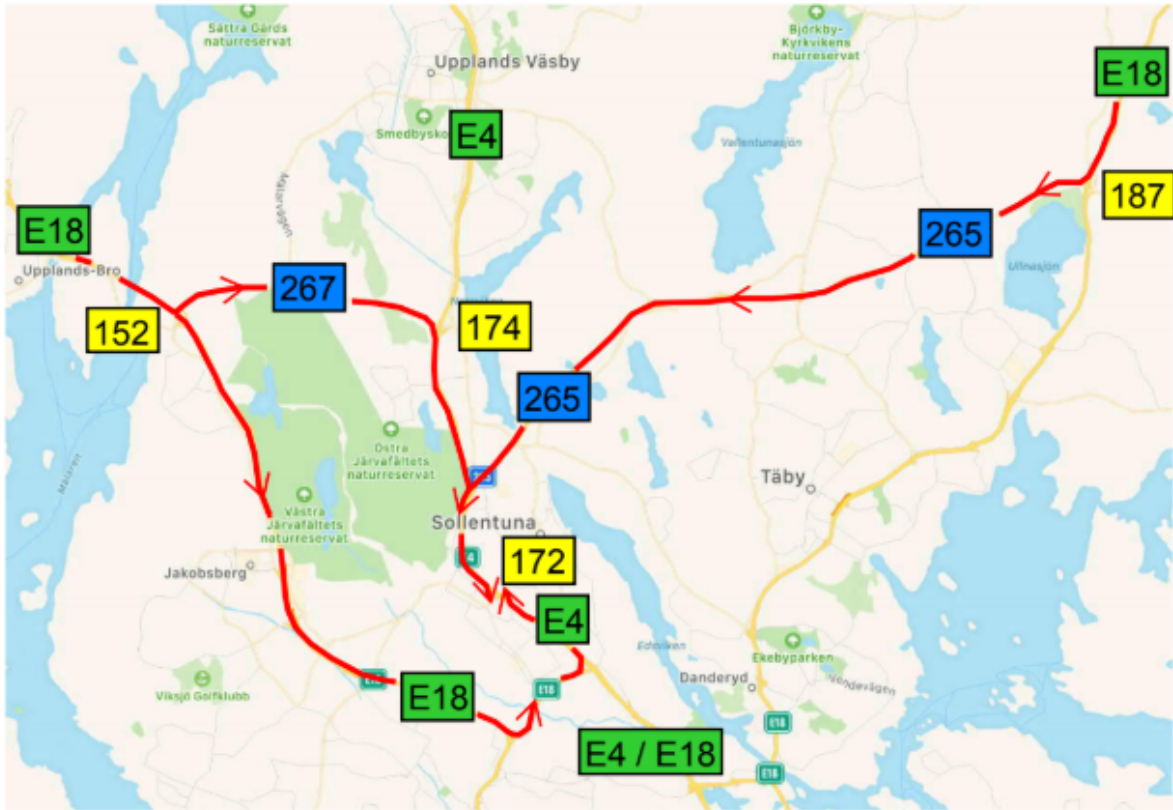
How to drive to intersection Tureberg, exit nr 172 on E4